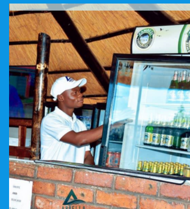
Bar - Chirundu